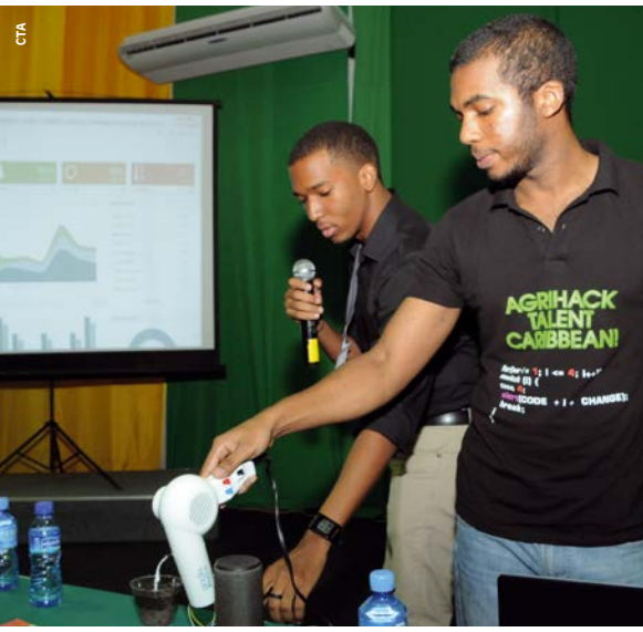
Photo on the right: Winners of the AgriHack Talent Caribbean in 2014.

their produce. This segment relates directly to revenue generation for farmers and thus has attracted an important amount of mobile applications and entrepreneurial initiatives. M-Farm in Kenya, launched by three young women in 2010, is one of the most prominent examples. Others include AgroCentral in Jamaica and MlLouma in Senegal. Also important in this segment are agribusiness and supply chain management services (e.g. mFamrs, Ghana) which can greatly improve efficiencies.